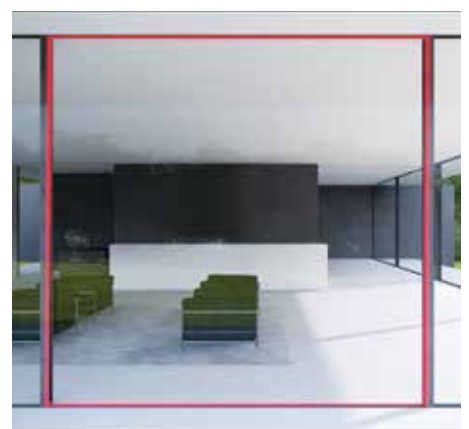
Seal active – 100% sealed