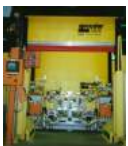
Machine Guard Automated