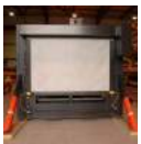
High Speed Fire Resistant Conveyor