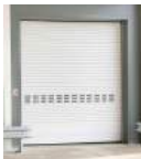
Roller Shutter Fire and/or Security