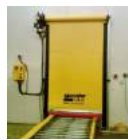
Automatic Conveyor Door