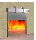
Fire Shutter to UK or US Standards