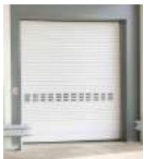
Roller Shutter Fire and/or Security