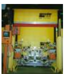
Machine Guard Automated