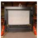
High Speed Fire Resistant Conveyor