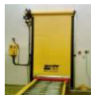
Automatic Conveyor Door