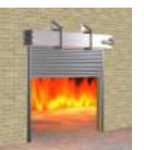
Fire Shutter to UK or US Standards