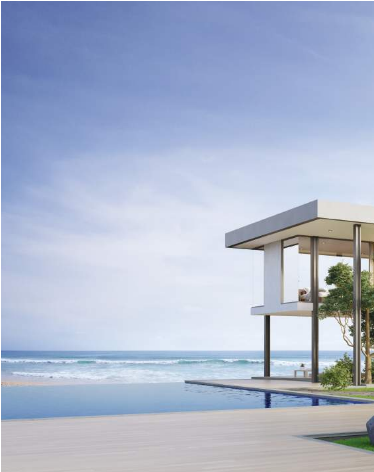
Langebaan, South Africa Private residence, 100 m from the sea