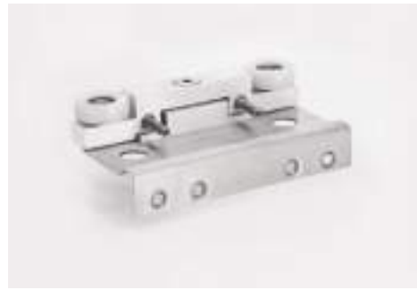
Upper guide carriage made of V4A and anodised aluminium

In salt spray tests, the maritime system achieved significantly better technical and aesthetic results than the standard version.