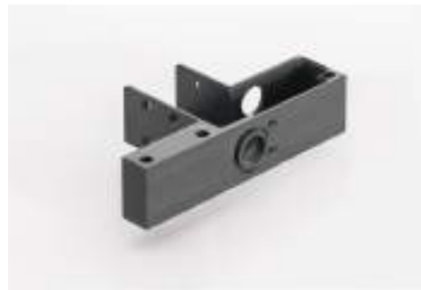
Milled locking bolt housing