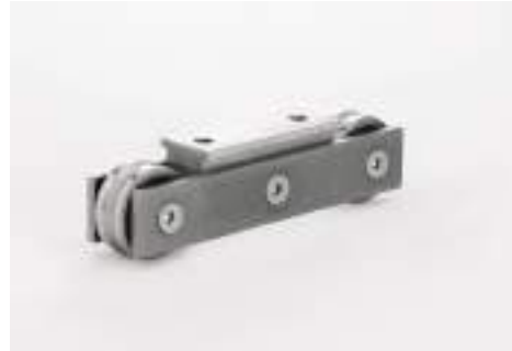
Carriage made of V4A and tempered rollers