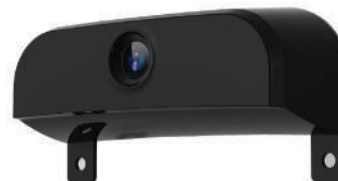
Thermal Sensor Module